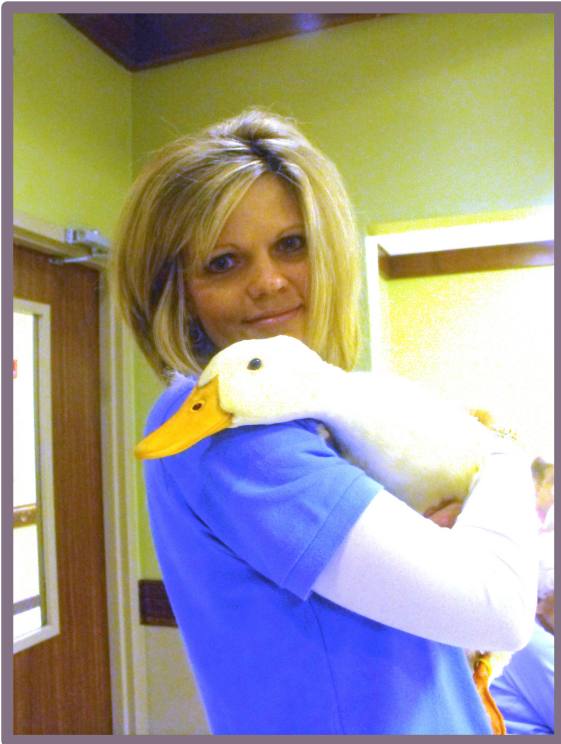
Sunny, the Pekin Duck, at Pebble Creek Nursing Home

Our Farm Animal Visitation Program has been making people happy for 5 years!