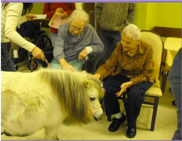
Kachina, the mini horse, at Pebble Creek Nursing Home